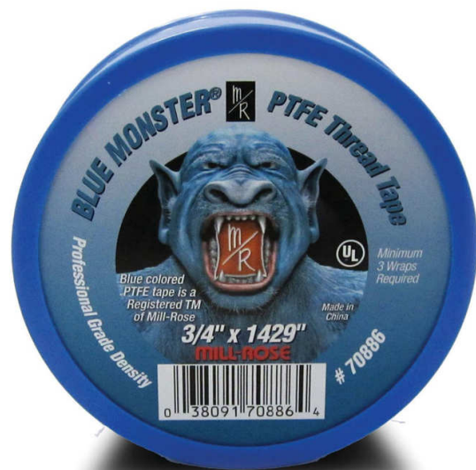
An example of the Blue Monster line of products, the line of PTFE tape stands out from others on the market due to its reputation for quality, reliability and its "personality."