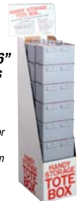
Point-of-sale floor display (#75624) requires less than two square feet.